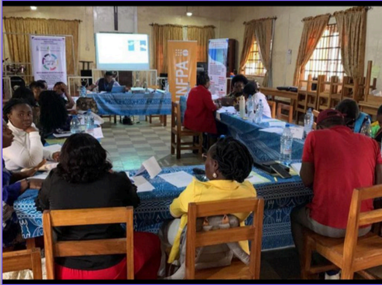
Promoting Mental health through sports