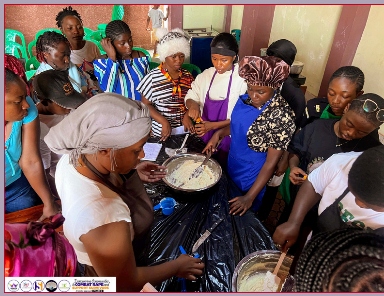
Skills acquisition training