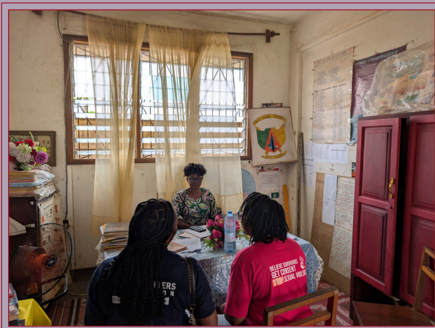
CP Response in Limbe