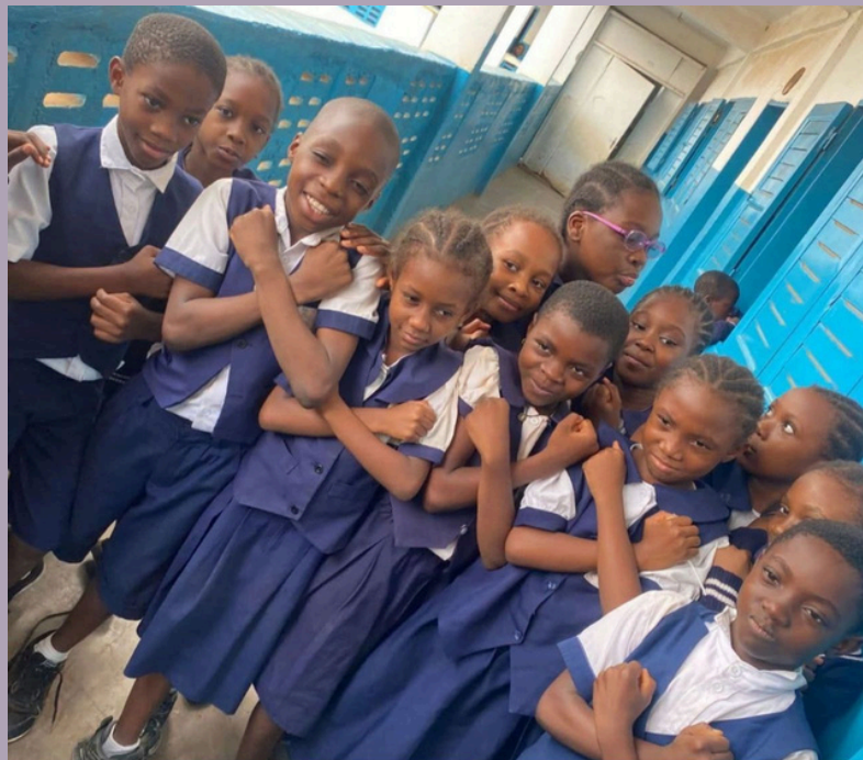
CP Response in Yaounde