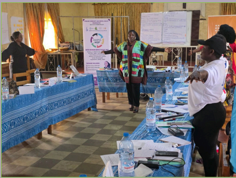
Promoting Mental health through sports