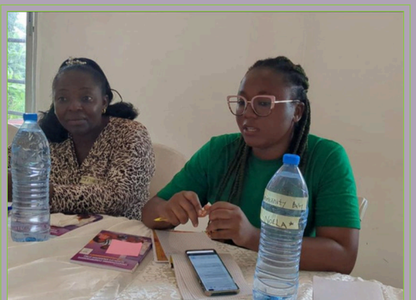
Promoting Mental health through sports