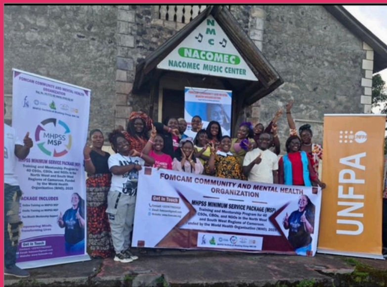
Talk on SRHR and personal hygiene

By addressing both the physical and psychosocial needs of children, Lead Child Africa contributes to nurturing healthier, more confident, and well-supported young people capable of reaching their full potential.