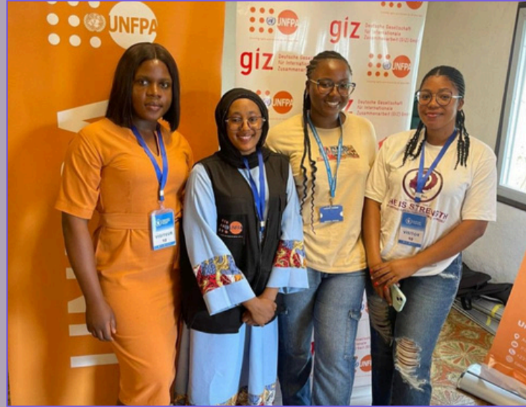
Promoting Mental health through sports